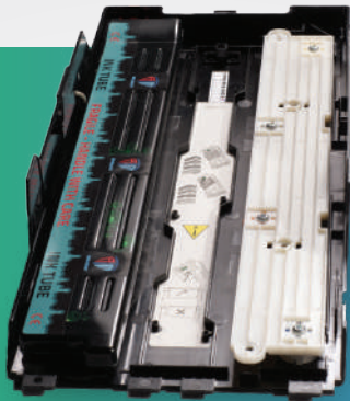
The ATM cassette equipped by INKASSET system