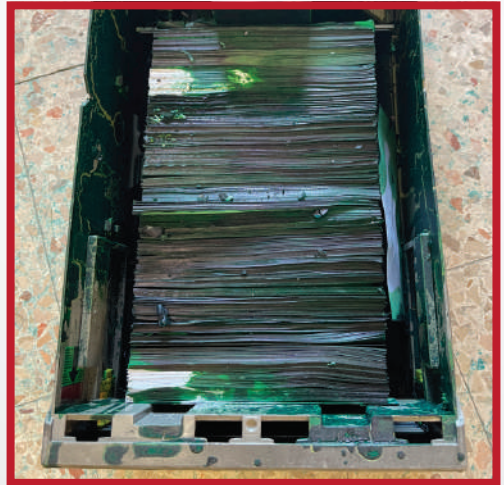
▲ ATM cassette after INKASSET is activated by detectors