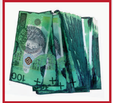
The money short time after INKASSET activation, active or passive