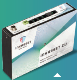
INKASSET CONTROL UNIT